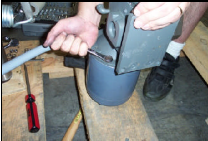
Tightening the bolts to secure the drive motor to the gear reducer.

30. Once the motor is securely fastened to the gear reducer, carefully lift the assembly up and mount it on the fasteners. Be sure to use proper lifting techniques to prevent injury.